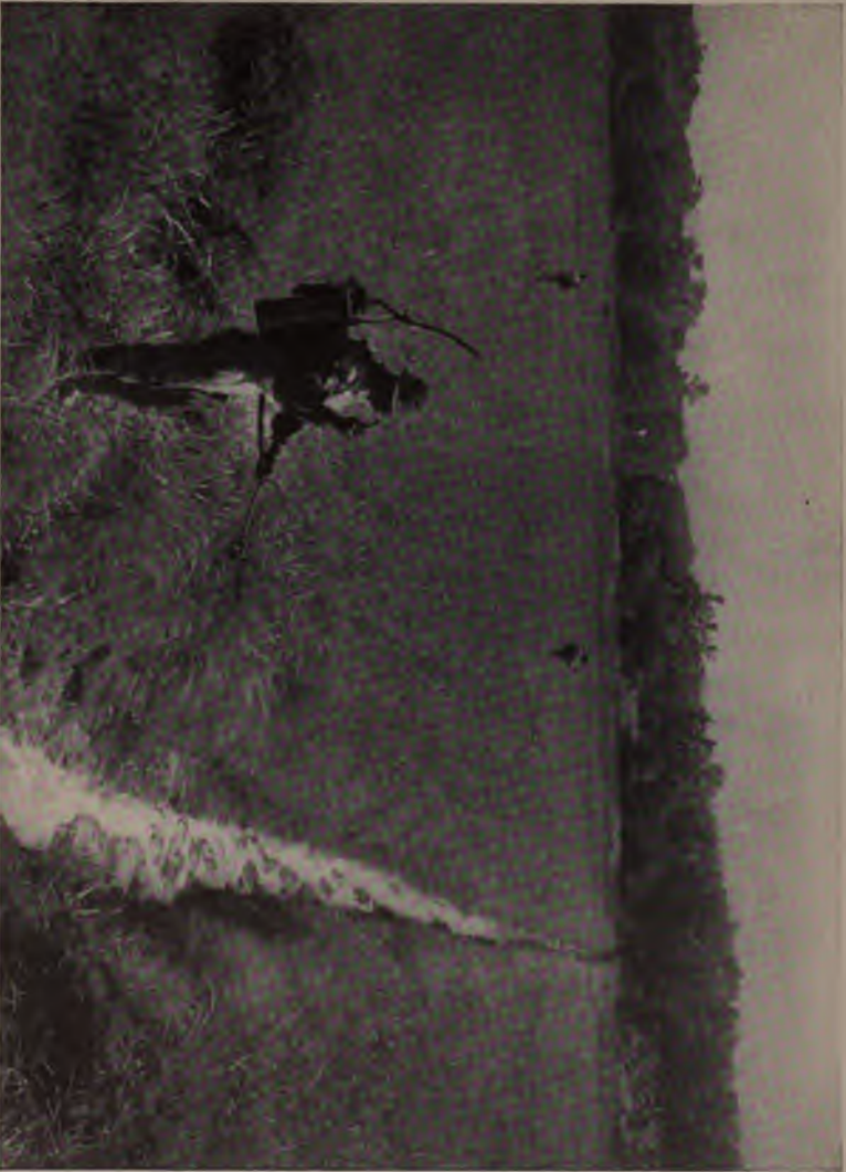
"They will have forgotten that we paid $43,000 a year for oil, and negroes to pump it on the pestilent mosquito"